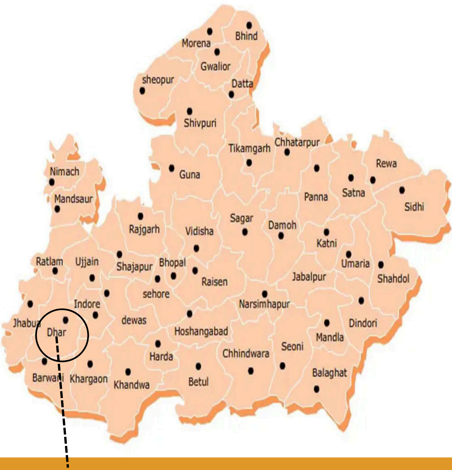
Mosque near Tarapur Gate at Mandu